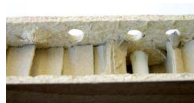
Drill bit comparison left: standard drill bit right: Stehle VHW Dowel Bit