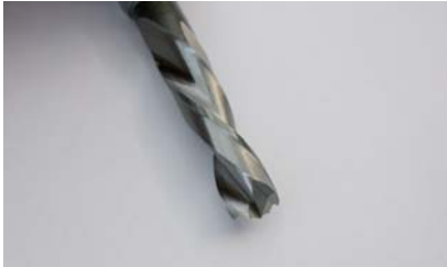
The Stehle 2042 VHW Dowel Bit